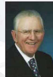
Alan Stoner Venture Capital Partners